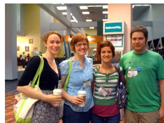
the Ravelry team!